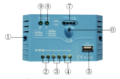
Figure 1 Product Feature