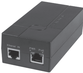
1 x Gigabit PoE Injector