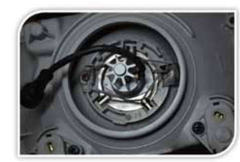
Align the snap ring to install the LED light and place the wire inside