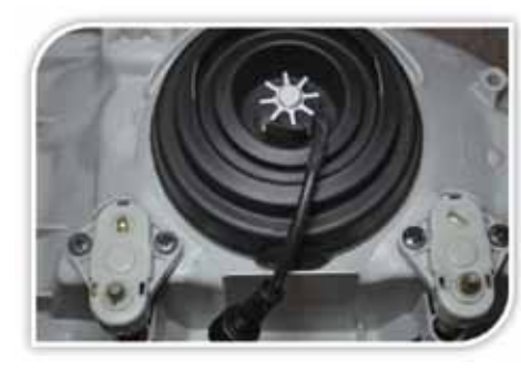
Place the dust cover over the fitting to avoid water getting inside