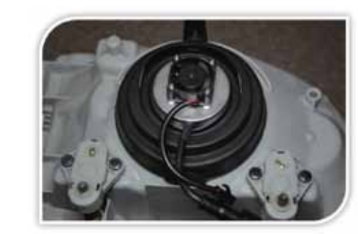
Rotate the LED light gently inside when installing the fan