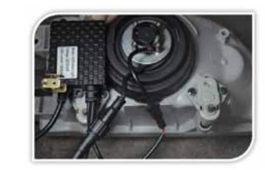
Connect the LED light, fan and the ballast wires together. Place the ballast near the LED light. Note: position may differ depending on the model of the car