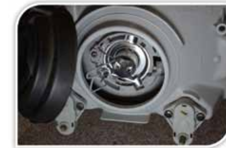
Open the dust proof cover of the light fitting