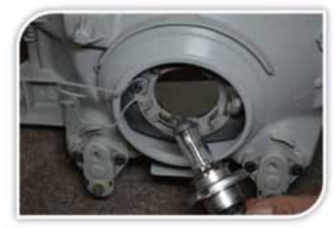
Take out the existing halogen lamp after unlocking it