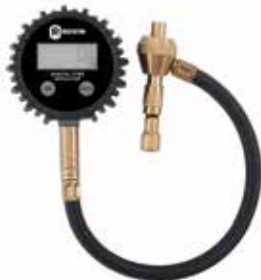
1x Digital Tyre Pressure Gauge