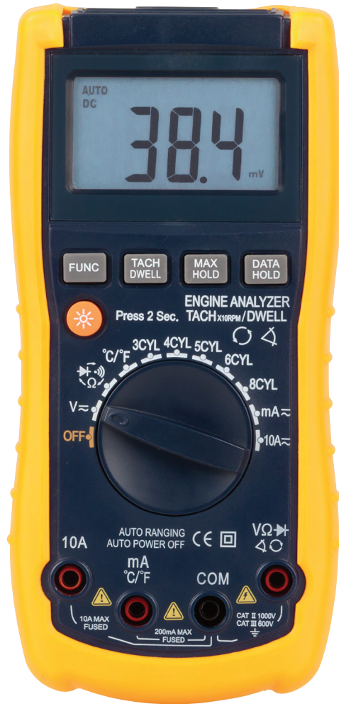
Automotive DMM with Dwell and Tacho Digital Multimeter User Manual QM-1446