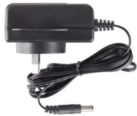
1 x Mains Power Adaptor