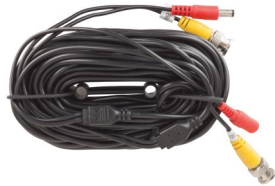
1 x 18m Video & Power Cable