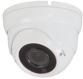
1 x 1080p AHD Starlight Dome Camera