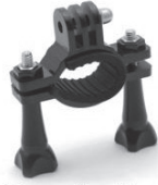
Handle Bar/ Pole Mount