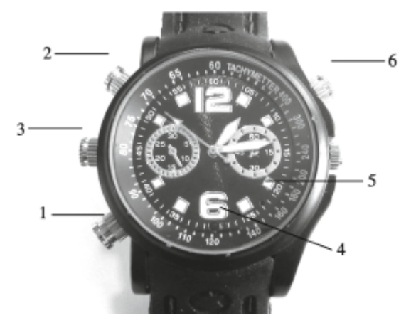
1: on/off, video 2: photo, audio 3: USB & charging connection 4: camera lens 5: indication light 6:Microphone