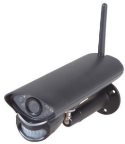
1 x Wireless Camera