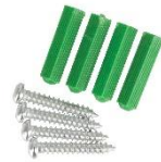
1 x Mounting Hardware