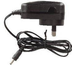
1 x Mains Power Adaptor