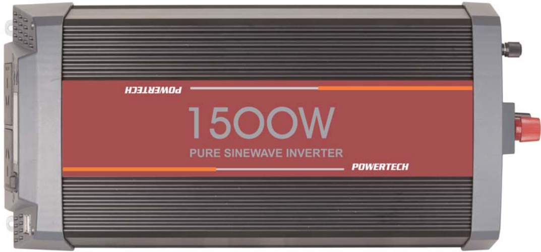
Top side of master unit