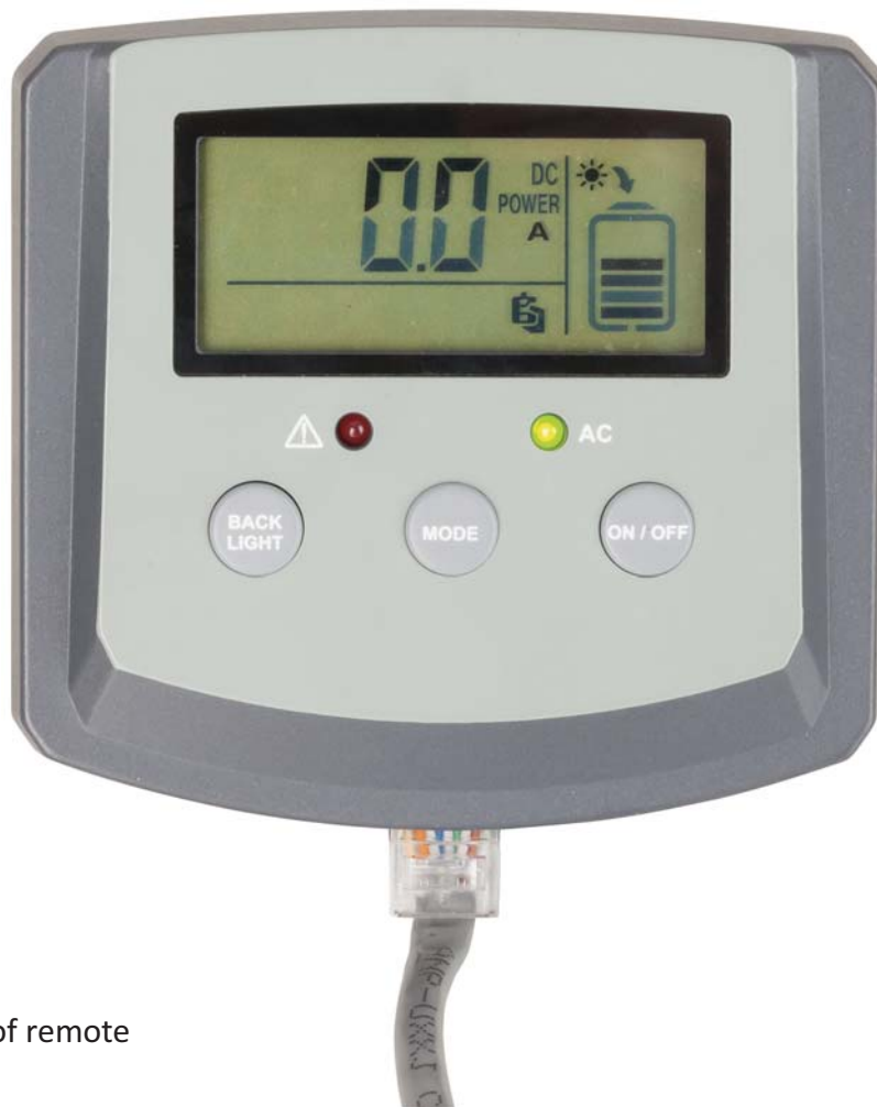
Front side of remote