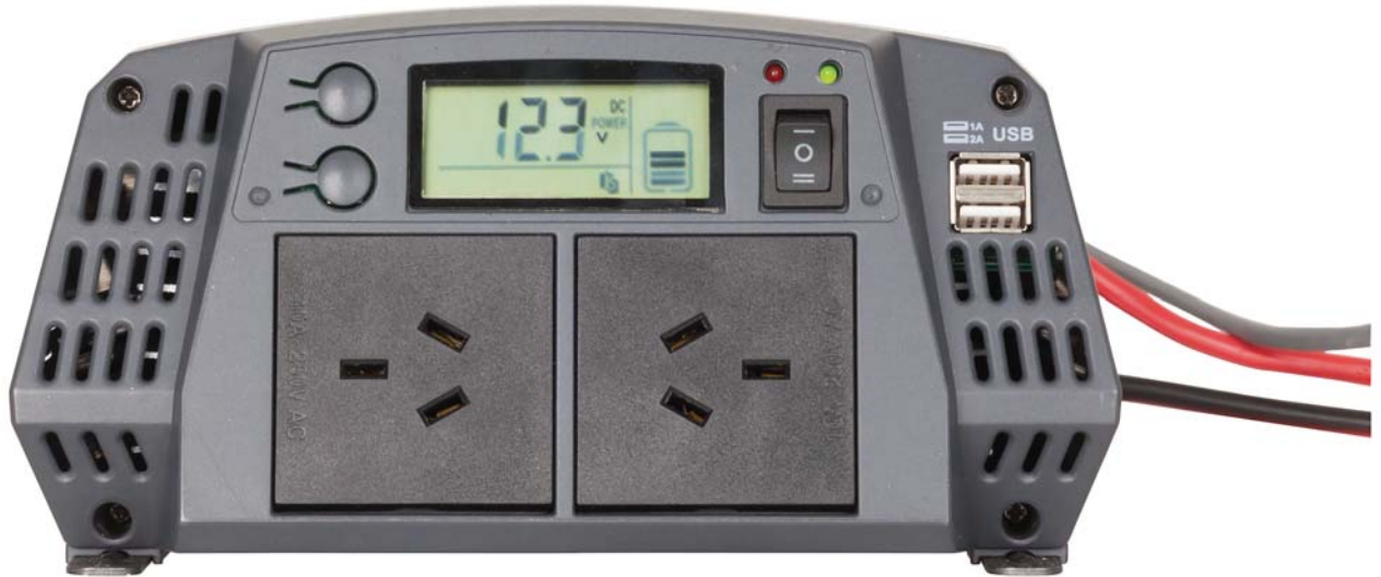
Front side of master unit