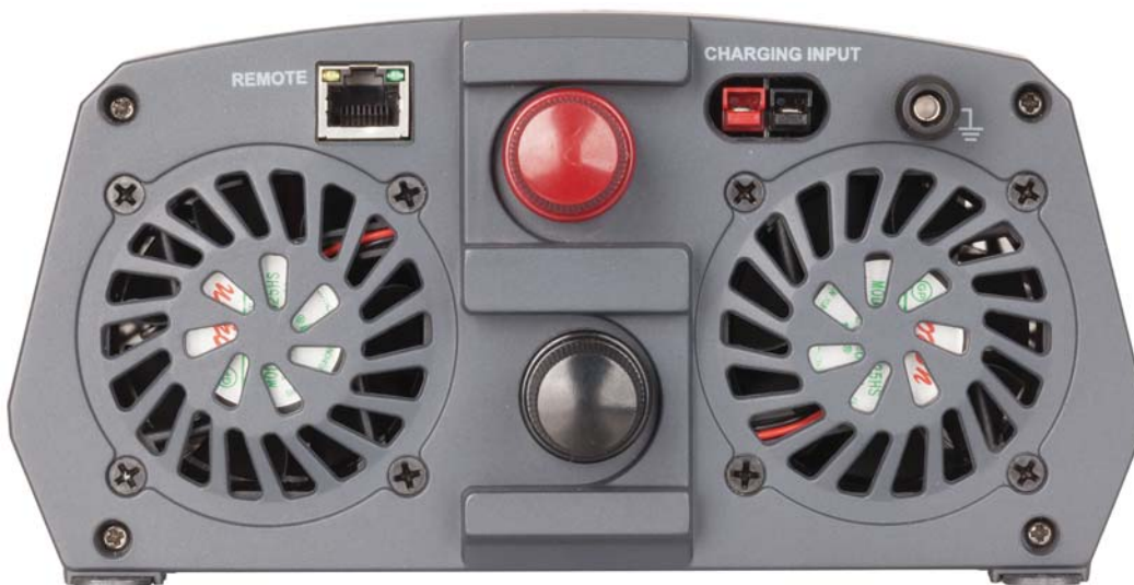
Back side of master unit