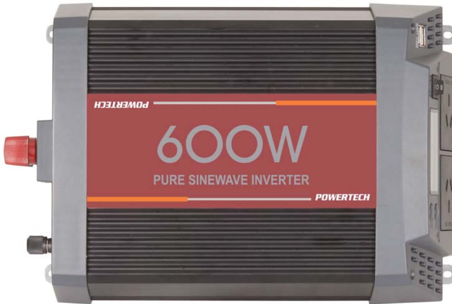
Top side of master unit