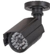
2 x Dummy Bullet Cameras