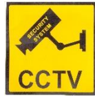
4 x CCTV Security Stickers