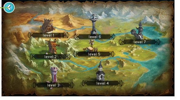
Select any one of the multiple difficulty levels.