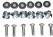
Mounting Kit 6 x M6 washers 6 x M6 tee nuts 6 x M6 x 20mm bolts