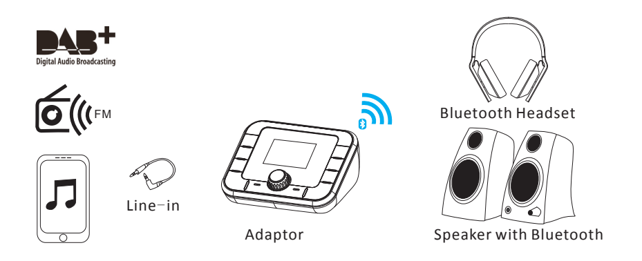
Bluetooth Transmitter Mode