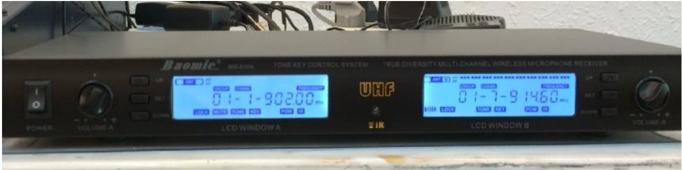
2. Push the "SET" button for 3 secs to unlock the receiver.