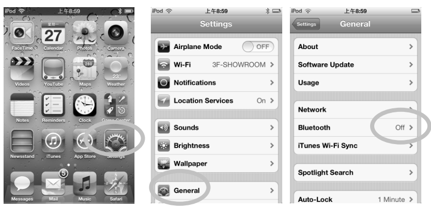
a .From your iPad/iPhone/iPod touch home page, tap "setting"

1. Go to Bluetooth manager of your iPad/iPhone/iPod touch by the following steps