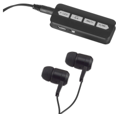
AA-2093 User Manual