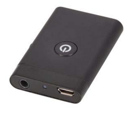
AA2085 Rechargeable Bluetooth Audio Transmit or Receive Dongle