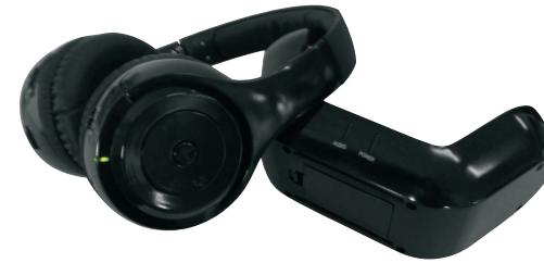
Wireless headphone and Transmitter cradle